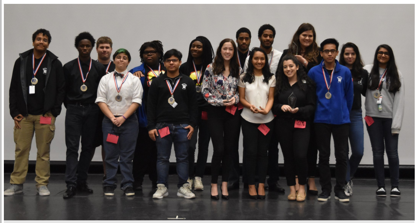
Last week, twenty students competed in Westside's Together with Tech Competition. Congratulations to our First and Second Place Winners who will be moving on to the District level in HISD's 2nd Annual Together with Tech Student Conference on April 7th at the Hattie Mae White Building.